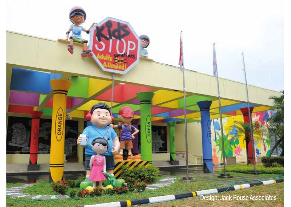
Design: Jack Rouse Associates

Spanning 2,300 square metres, KidsSTOP™ at Science Centre Singapore is the first of its kind in Singapore. Kingsmen completed works comprising the design, fabrication, and installation of the edutainment facility's façade, ticketing area, workshop corridor, music lab, events room and five characters. KidsSTOP™ aims to rekindle the spirit of exploration and discovery by engaging children aged eight and below in fun experiential learning.