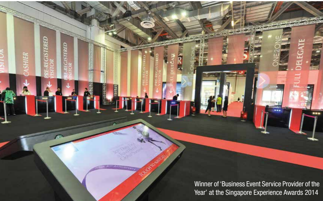
Winner of 'Business Event Service Provider of the Year' at the Singapore Experience Awards 2014

Working across a breadth of industries, we have the capabilities to provide turnkey solutions for trade shows and exhibitions.